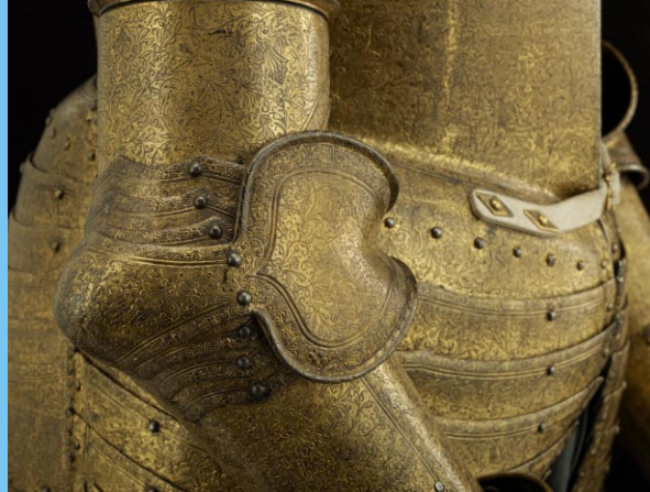
Armour of King Charles I (1612) and a detail of the decoration