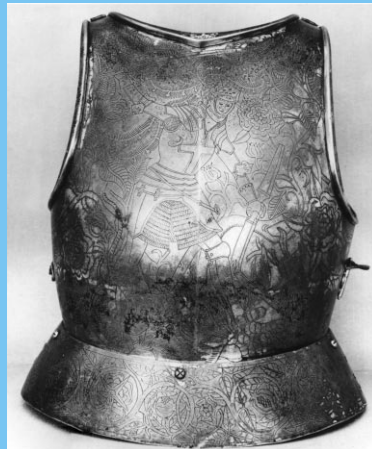
The silver and engraved armour of Henry VIII (1515) and the breastplate showing St George and the dragon.