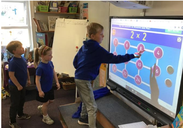
Practising times tables with "Hit the Button".