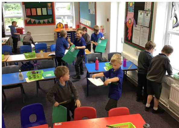
On a materials hunt in science.