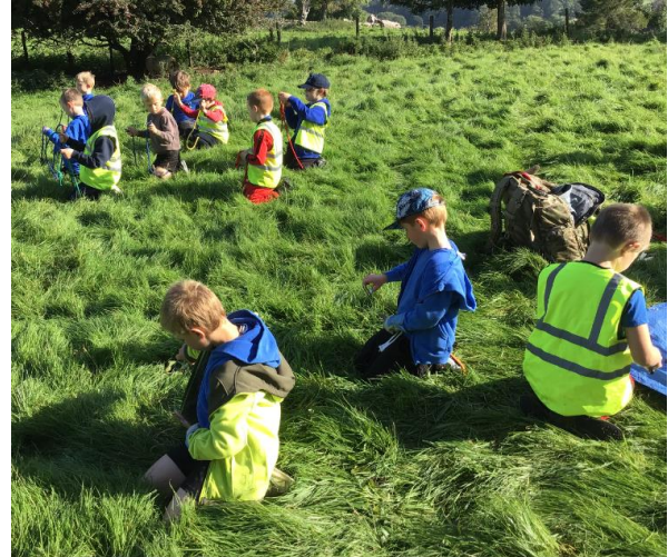
Fun at Forest Schools.