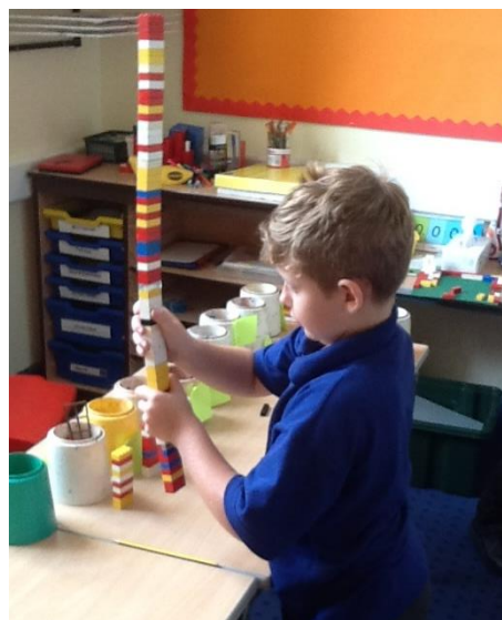
Alfie enjoying some maths